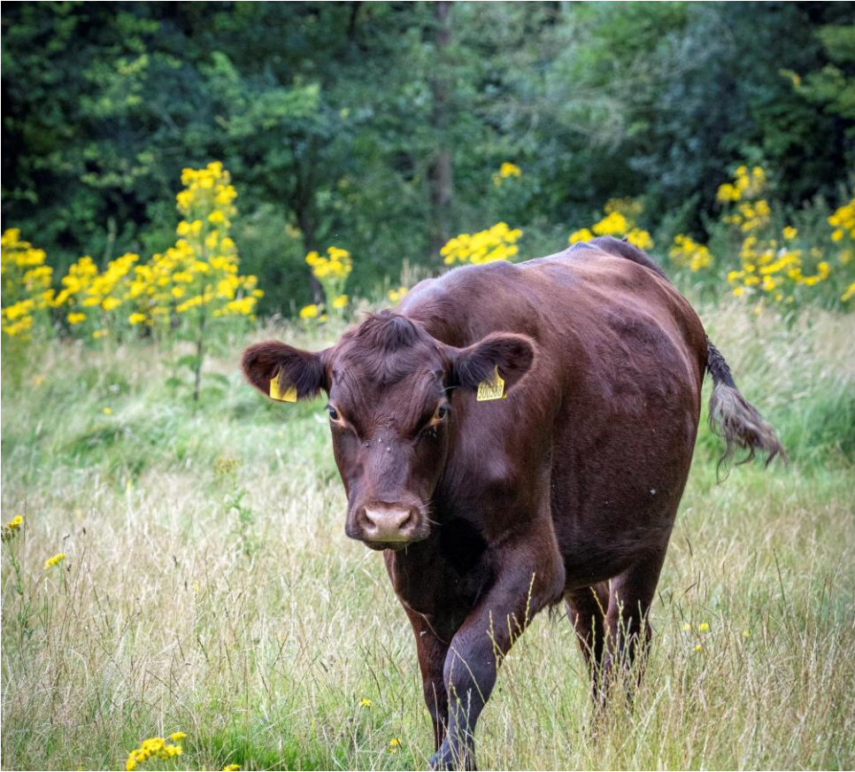
Red Poll cattle grazing at Weald Country Park

Some of the important work that is currently taking place at Weald Country Park includes the delivery of the parkland management plan to restore some of the original parkland features.