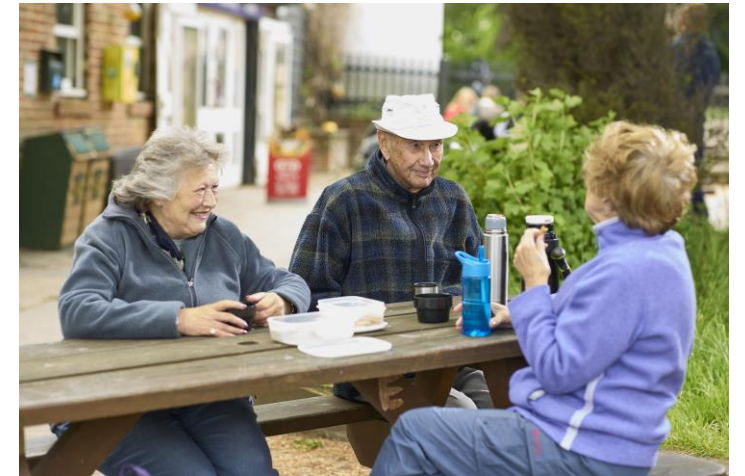
Weald Country Park