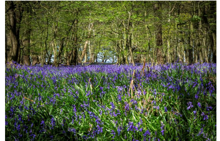
Weald Country Park in Spring