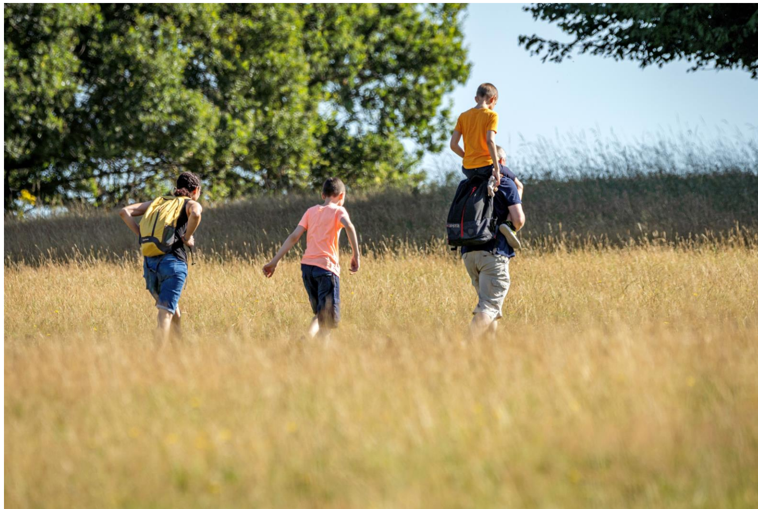
Weald Country Park